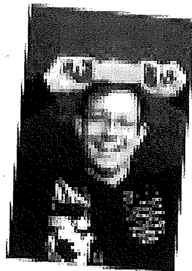
Mr. [illegible] [illegible] [illegible]