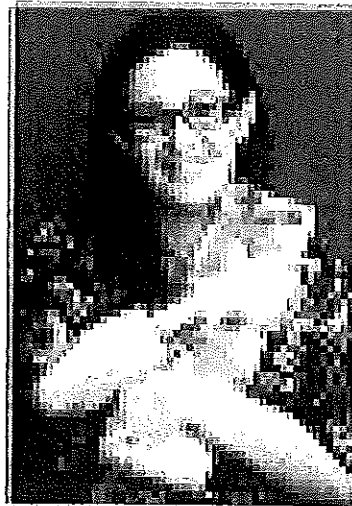
Mr. [illegible] [illegible] [illegible]